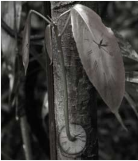
REPRODUCTION OF TIME – by Abdul Sadeer Bin Abd Salam